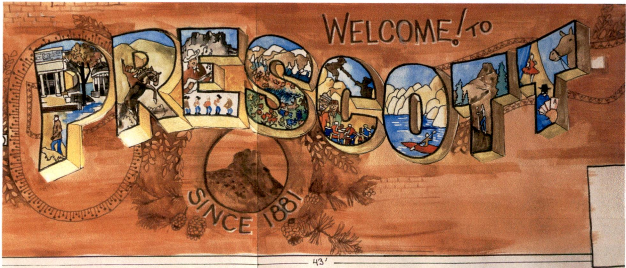
EXHIBIT B: DESCRIPTION OF THE ART

This mural will be installed on the brick wall in the alley across from St. Michaels. The bricks are over 100 years old so it was decided to paint on a composite sign material and install it over the bricks. The sign